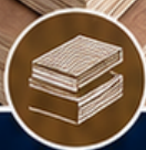
PLYWOOD & MARINE BOARDS