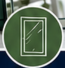
MIRROR & GLASS PANELS