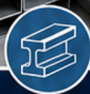
METAL & STEEL PRODUCTS